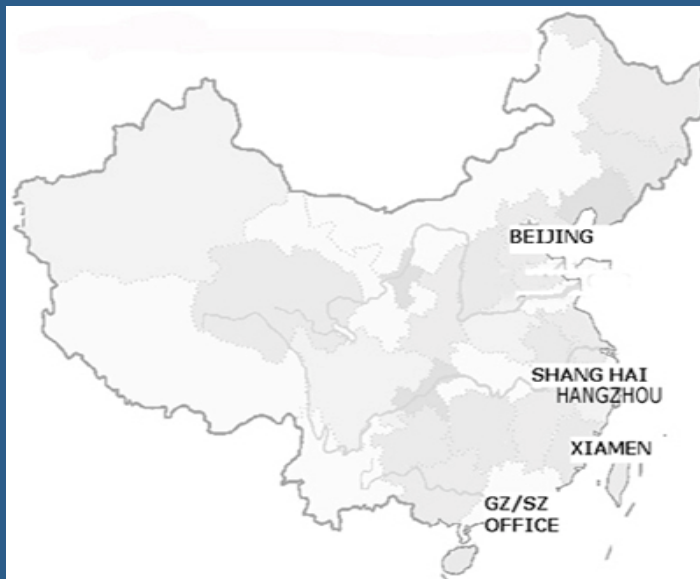
Graph 1 China Mainland Office Span

ALLY INFORMATION SERVICES CO., LTD (AIS) was registered in 2000. We have now six offices and hired more than 100 consultants in China Mainland, engaging in consulting services on ethical standard, supplier chain safety, quality management system and EHS management system for China local factories.